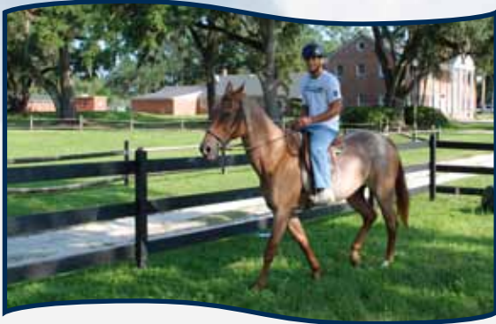
Pictured above, a resident rides one of the horses provided at the Children's Homes' Jacksonville campus.

The Children's Homes has been serving abused, neglected, and orphaned children since 1904. We have three major service areas; campus ministries, community ministries, and international childcare missions.